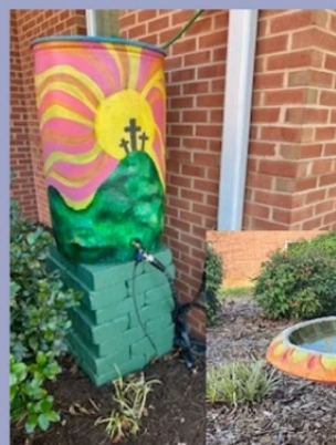
Rain barrel and bird bath