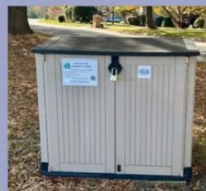
Compost collection bin