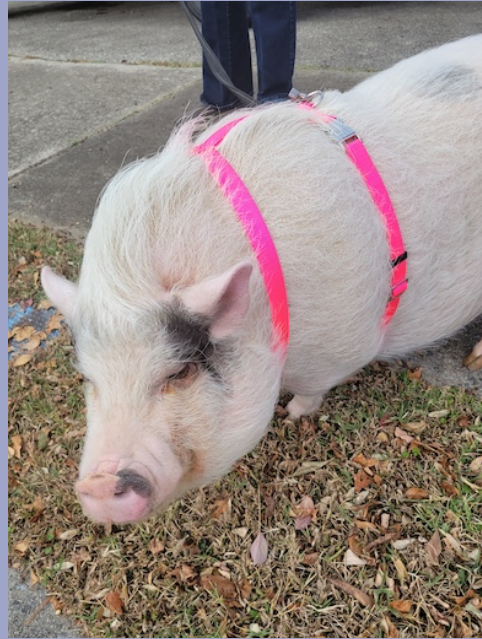
145 pound Lucy, which we discovered enjoyed copious amounts of chocolate chip cookies