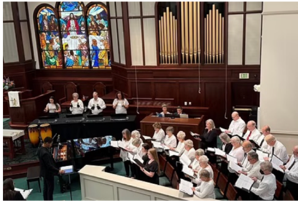
"Singing Our Faith through Hymns and Anthems" Hymn Festival in Newton, NC on June 1, 2025

- Sponsored by the Mid-Atlantic Region (VA and NC) of the Presbyterian Association of Musicians, a 50+-year-old national organization that offers worship support, job listings, church music certification, and annual summer conferences. https://www.presbymusic.org/