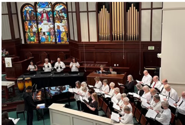
"Singing Our Faith through Hymns and Anthems" Hymn Festival in Newton, NC on June 1, 2025