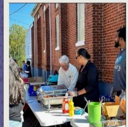
Grace Community Resource Day