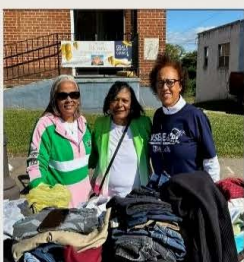
Grace Community Resource Day

Over the summer, Grace, First Collinsville, First Martinsville and Forest Hills Presbyterian Churches joined together the second Sunday of each month for worship and fellowship. And in October, the other churches helped support Grace's Community Resource Day. Everyone benefitted from the partnership. Pews were full, more voices carried the music, pastors got a respite from preaching, relationships were built and strengthened, and the community got to see a strong, vital, vibrant Presbyterian presence.