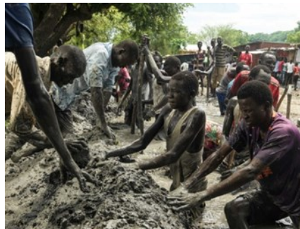
Volunteers build a large dike to contain floodwater that has inundated a soccer field. They are creating a dry area for helicopters carrying emergency aid to land. (September 2021)