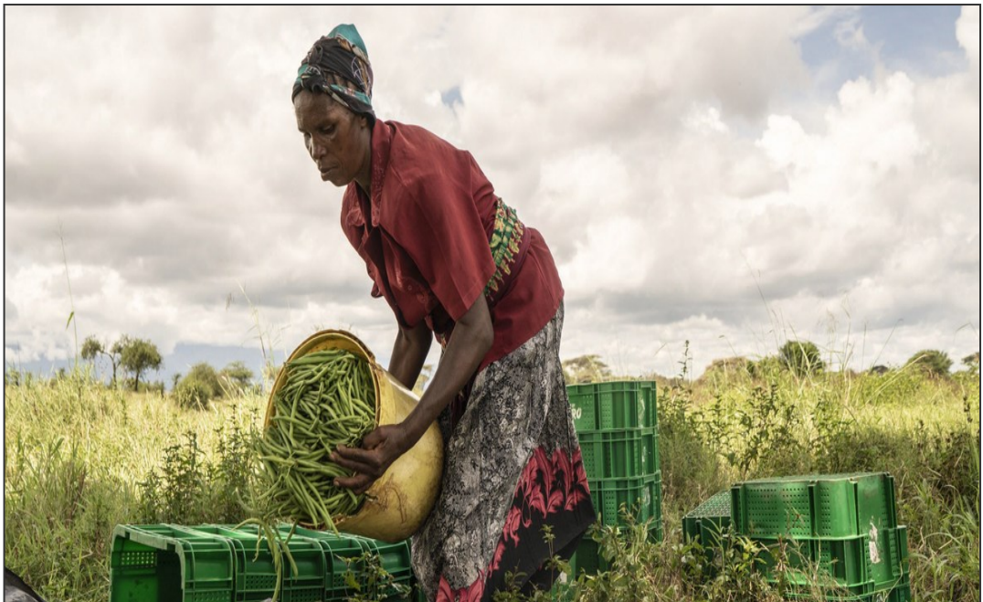
A woman sorts French beans that she harvested at a cooperative farm in Taveta, Kenya.

Reversing this situation will likely take years if not decades, maintained the World Food Programme ( WFP ), Food and Agriculture Organization FAO , the International Fund for Agricultural Development ( IFAD ), World Health Organization ( WHO ) and UN Children's Fund, UNICEF .