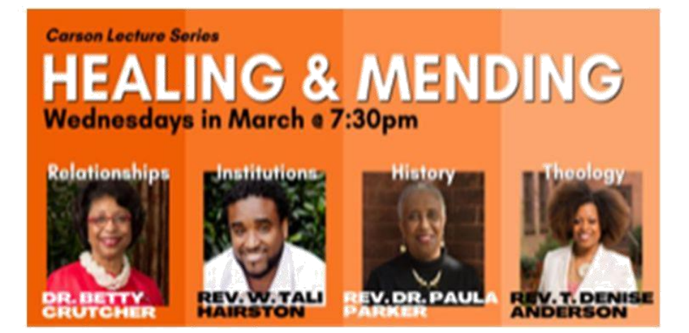
HEALING & MENDING: Our Relationships, Institutions, History, and Theology